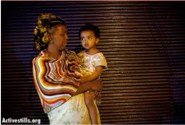
A mother cries after she was attacked by an Israeli mob and her baby was thrown to the ground (May 23, 2012)

from Sudan, Asians from Sinai. Whoever touches Israel's border – shot." He later conceded that such a policy may not be feasible "because bleeding hearts groups will immediately begin to shriek."