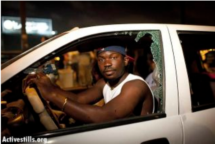
A refugee from Ivory Coast drives his car after an Israeli mob smashed his windows (May 23, 2012)

bombings of apartments and a nursery school in an area in which African migrants live. Shops run by or serving migrants were smashed up and looted in violent demonstrations in which several Africans were attacked. 3